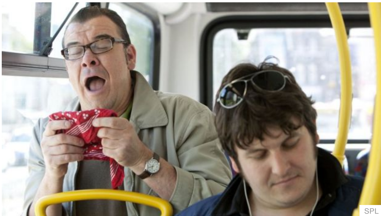
Watch out for him in the mornings.